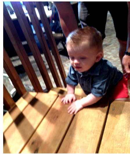
Children were able to play in the treehouse