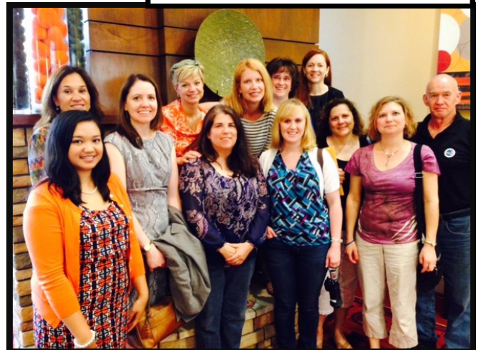
The NPKUA Representatives