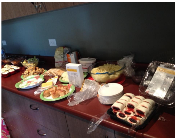
Some of the yummy snacks Cambrooke provided

On June 6 th the PKU Organization of Illinois hosted the annual Parent Café at Grounds for Hope Café in Lisle. It was an opportunity for parents of children with PKU and PKU mothers to mingle with other parents while the children had an opportunity to play in the treehouse and work on crafts. PKU friendly snacks were provided and Cambrooke provided low protein foods to sample. This year was the most attended Parent Café.