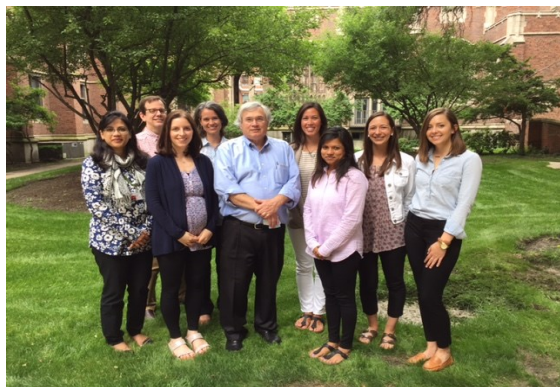
UIC Chicago Clinic Staff