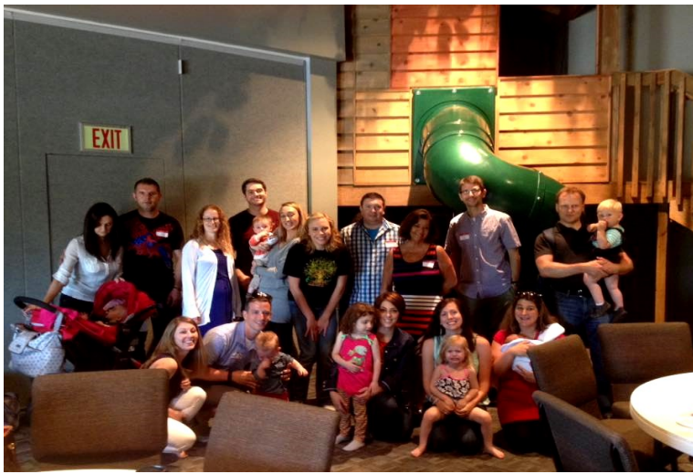
Roughly 21 people came out to attend our annual Parent Café